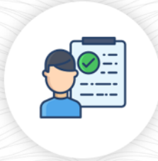
Staff Attendance Management