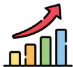
Salary Increment by Manager