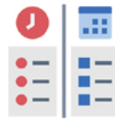
On Duty Slip Detail