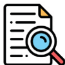
View All Employee Grading