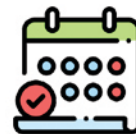
Monthly Grading Details