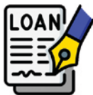
Loan & Advance Statement