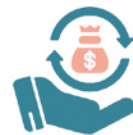
Salary Revision History