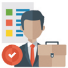
KRA Form Manager